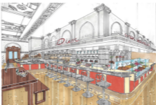
Rendering of diner inside the Kress building.

A full-service restaurant will also be on the same level along with retail spaces.