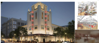
Rendering of the outside of Kress building.