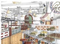
Rendering of inside vendor space inside the Kress building.

A total of nine separate kitchens and five retail areas dedicated to local vendors will be housed within the first and second floors.