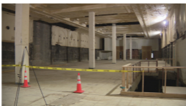
Inside Kress building on Thursday, April 27, 2023.

So far, the building from the inside has already been demolished and cleaned up.